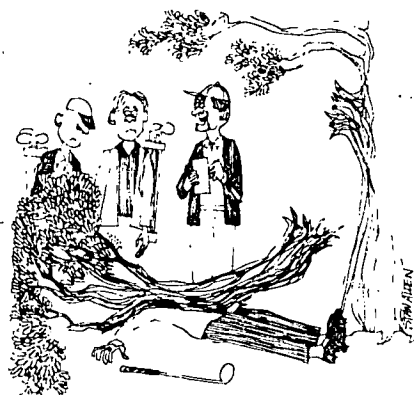
"You go call the ambulance and I'll figure up how much he owes us before he leaves."

It's reassuring that some colleges are putting more emphasis on education again. One college in our state has gotten so strict, it won't even give a football player a letter unless he can tell which one it is.